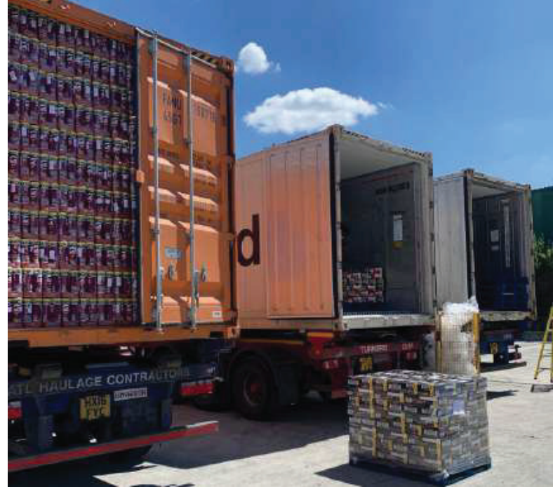
#VISIT OUR UK WAREHOUSE #

PREMIER EXPORTS LONDON LIMITED UNIT 11, TRADE CITY, KINGSWAY LUTON, BEDFORDSHIRE, LU11FW, UNITED KINGDOM